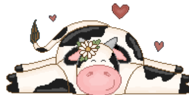
I love cows